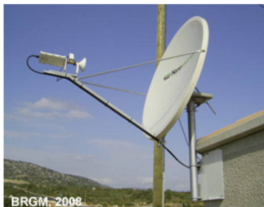
Detail of the VSAT antenna