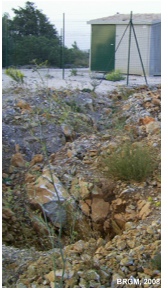
Geological conditions: Rocky outcrop (limestones with rudistids, Upper Aptien - Lower Cretaceous)