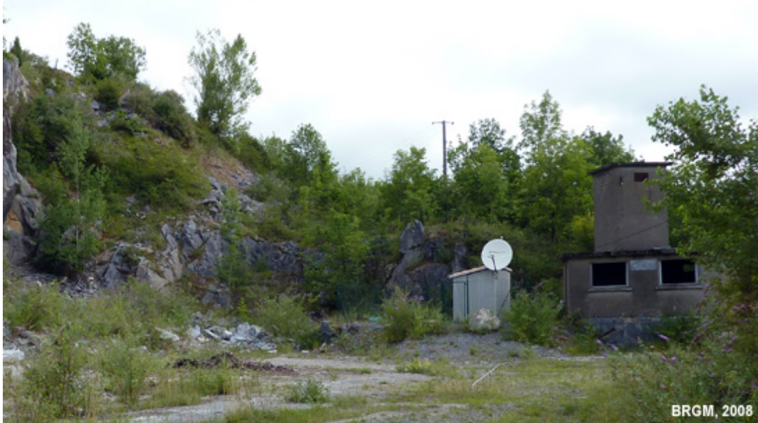
Detail of the fence with the instrumental house, VSAT and GPS antennas